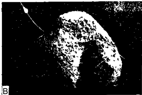
Fig 2 A Monosyringa longispinna General morphology B Hexactinellid No 1 General morphology (note the presence of a small bud attached to a spicule)

Colour Body pale white and tubes light brown in dry condition